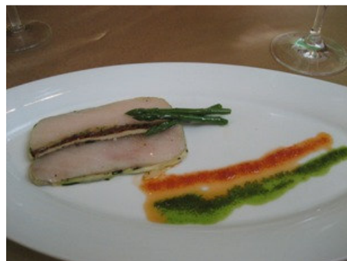
White Tuna, Mediterranean Vegetables & Basil Oil