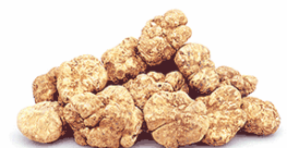
"The white diamond in the kitchen"

The white truffle shouldn't be confused with summertime black truffle of Vaucluse or Périgord, which is also whitish, but smells and tastes totally different.