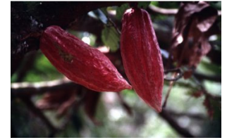
"Chuao Cocoa Pods."